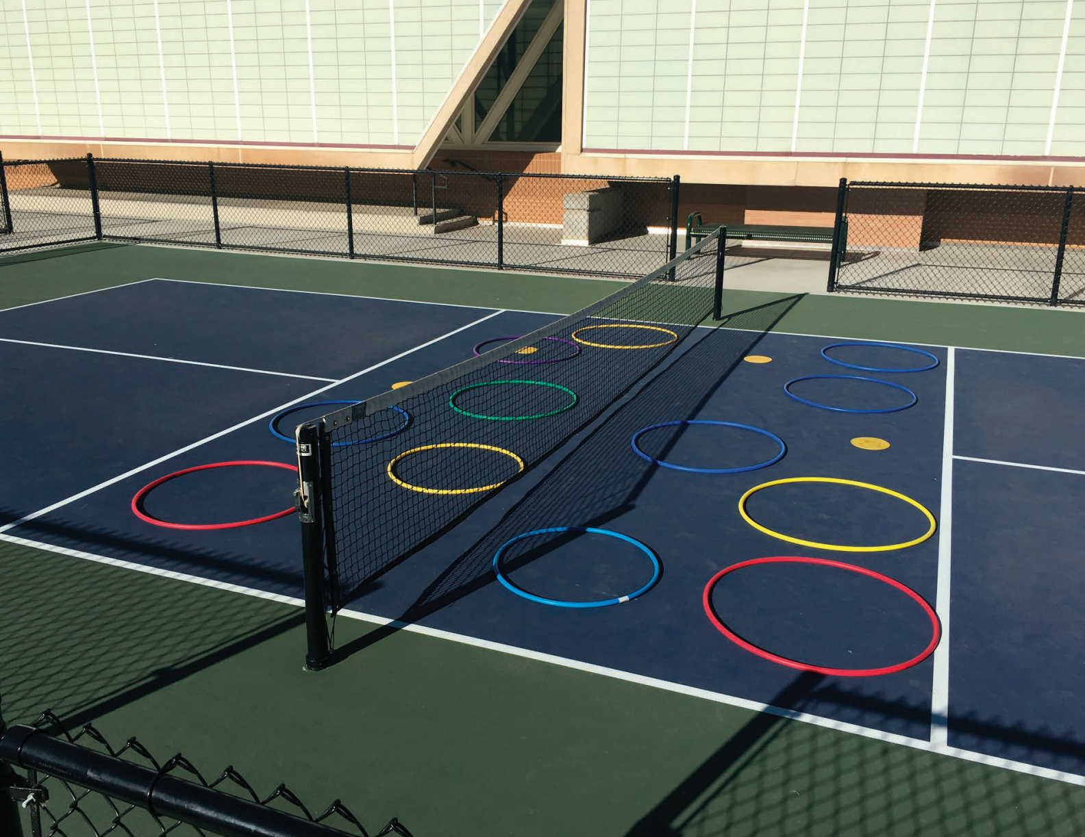
Figure 1. “You Dinked My Battleship” gameplay setup. The yellow poly spots represent the Doolittle Raiders variation.

teams try to get the ball to land in the hula hoops. Rallies are encouraged over start-and-stop play. Thus, a team may get to sink multiple hula hoops before the point is over. A rally is over when the ball lands out of bounds, cannot be returned, or does not go over the net. After each rally, each team removes the hula hoop(s) that were sunk. Game play continues until one team has all of their battleships sunk. Teams can reset and play as many times as allowed.